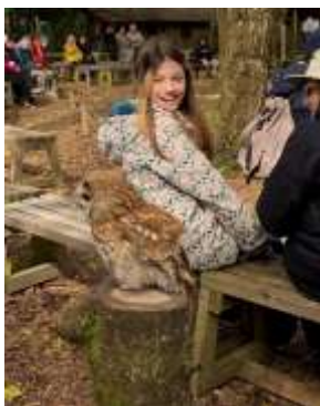
The Hawk Conservancy